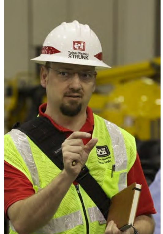
USACE Recon Member

Completing this mission was an incredible effort involving 28 personnel covering 25,000 driven miles over 22 days (averaging 12 hours/day). Approximately 5 million square feet (SF) of public buildings and 388,000 SF of military facilities were assessed. Results of these assessment led the State, through FEMA to request the District to award a contract and oversee the design and construction of two facilities, the Oklahoma State University Medical Center in Tulsa, OK and the Integris Baptist Portland Campus in Oklahoma City, OK. In addition, a third mission assignment was received May 19, 2020 for Tulsa District to assess the Memorial Hospital of Texas County in Guymon, OK. This brought the total number of assessments to 33. This assessment resulted in the third facility in the State that Tulsa District was tasked to award a contract and oversee the design and construction of.