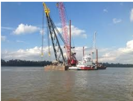
The Salvage Team

While the barges were loose, the Oklahoma Department of Transportation had closed Interstate 40 as a precaution. The interstate is located just south of the Webbers Falls Lock and Dam.