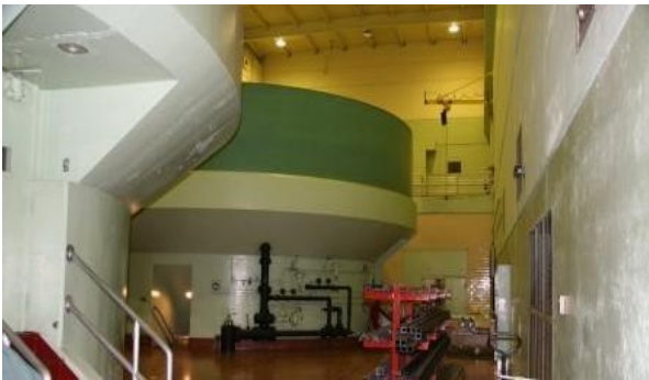
Inside a Power Plant

The U.S. Army Corps of Engineers multi-purpose dams are the largest producer of hydropower in the United States, and one of the largest in the world. The Corps' hydropower plants provide 100 billion kilowatt-hours annually, enough power to serve more than 10 million households. Operating 353 units at its 75 hydropower plants the Corps dams and reservoirs produce one-fourth of the nation's hydroelectric power. One of four Power Marketing Administrations in the United States markets the power produced from these plants at average annual revenues of $142 million to the U.S. Treasury.