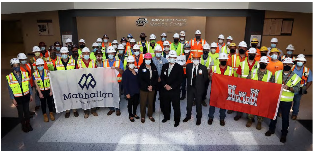
The Manhattan—USACE Team