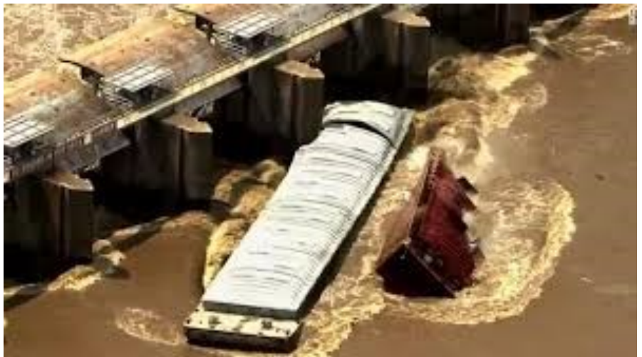
The Barge Strike

On May 22, 2019, two barges carrying ammonia fertilizer had become loose and proceeded to travel downstream within the Arkansas River, at times traveling 45-50 miles per hour. Before reaching the lock and dam, they were temporarily wedged on a sand bar during the night. The next day, both barges struck the lock and dam at 11:55 am. At the time, the gates were open and the strike had impacted Gates 6-10. If the gates had been closed, they would have been damaged by the barges.