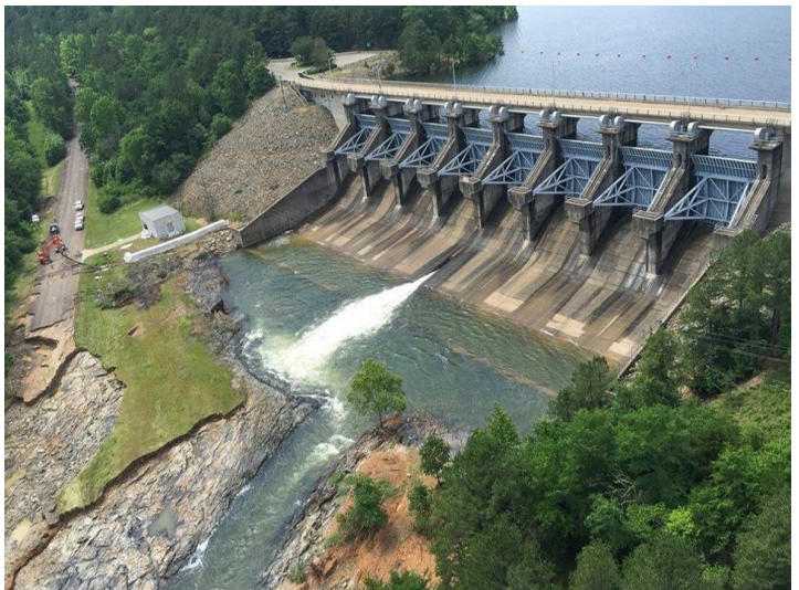
Broken Bow Dam

Broken Bow is located in the south-eastern part of the state of Oklahoma, stretching twenty-two miles back into the Quachita Mountains in McCurtain county. Broken Bow is one of eight hydroelectric power plants managed by the Tulsa District, with a total portfolio of twenty-two units with a generating capacity of 584 megawatts. Seven of the plants are located within eastern Oklahoma with one located just across the border in Texas. These plants benefit approximately two million end users throughout Oklahoma, Texas, Arkansas, Missouri, Kansas and Louisiana.